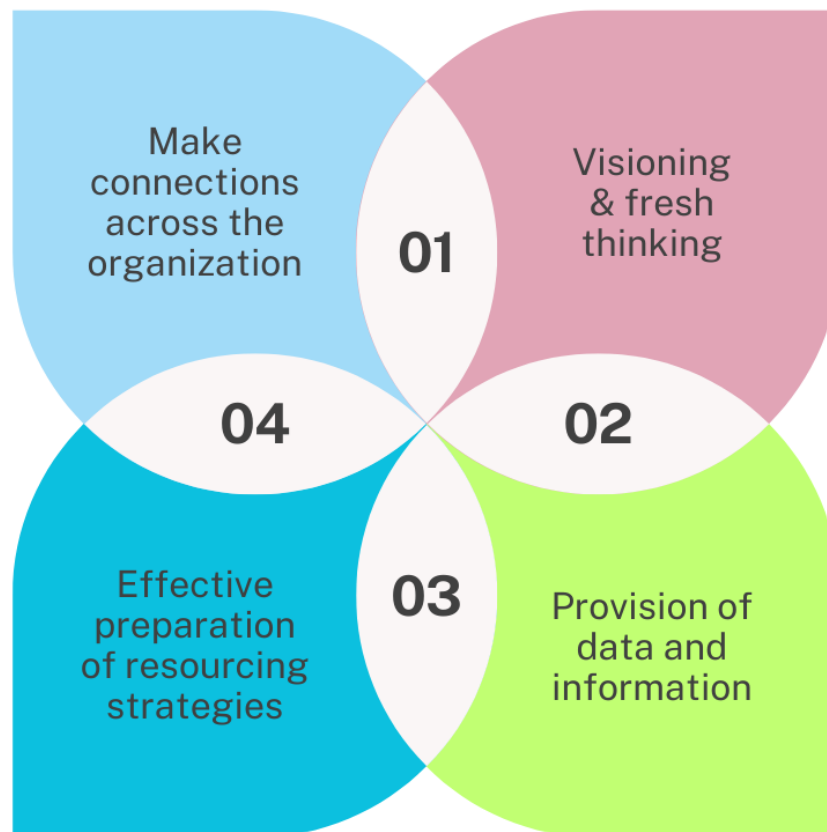
Figure: 3 showing importance of data loss prevention

Because of the amounts of these unstructured data such as emails, documents, image files, etc., the organizations have a difficult time trying to work out which data should be managed more securely. Traditional methods of classification are slow and imprecise and the unconventional methods of classification are decentralized; whereas the climate tools and methods for classification need a fine data to be processed and it might have problems with the complexity of the data. For example, some data may be placed in folder's subfolders, some data may not be tagged unified or with