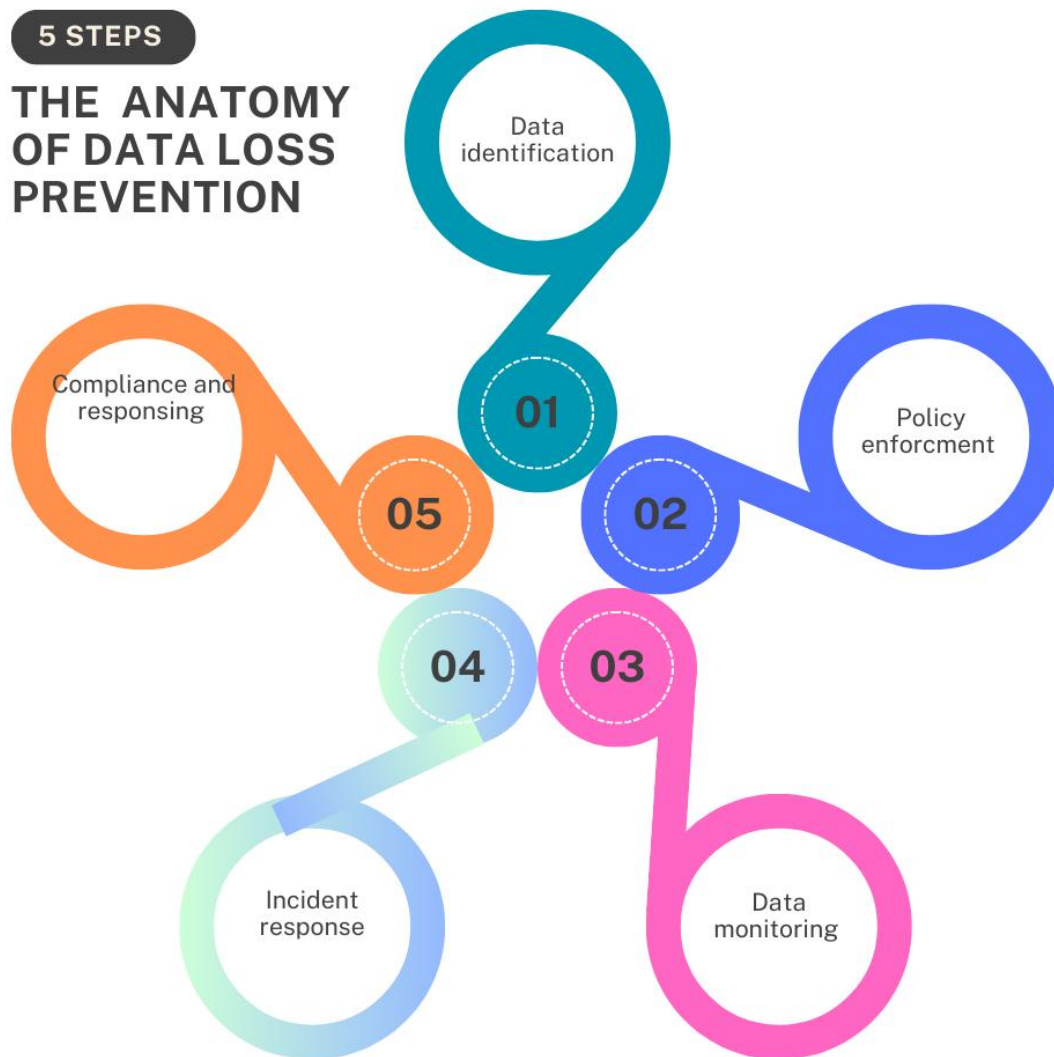
Figure: 1 showing the anatomy of data loss prevention

DLP stands for Data Loss Prevention and is a set of tools, strategies and initiatives meant to stop the leakage, theft or loss of information. These components are essential to managing and securing an organization's network, endpoints & storage. The main areas of DLP can be defined broadly as identification/classification of data, encryption/masking of data and protection/monitoring of endpoints [6]. Alchemy of these components creates a strong framework, which can protect against data leakage in addition to being compliant with the legal requirement on data protection.